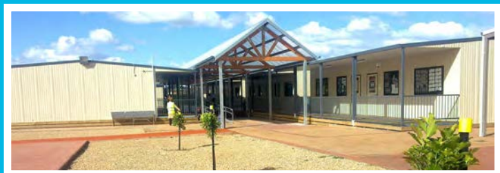
IBRAHIM DELLAL CAMPUS, SUNSHINE