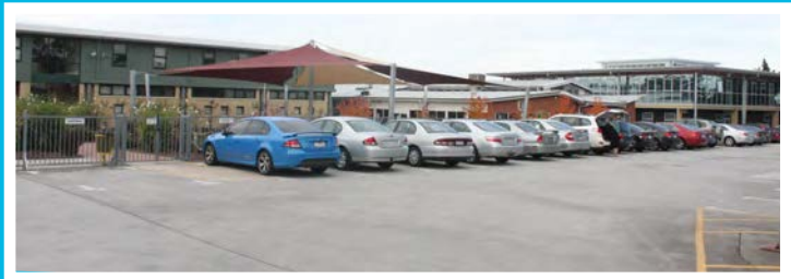
EASTMEADOWS MAIN CAMPUS