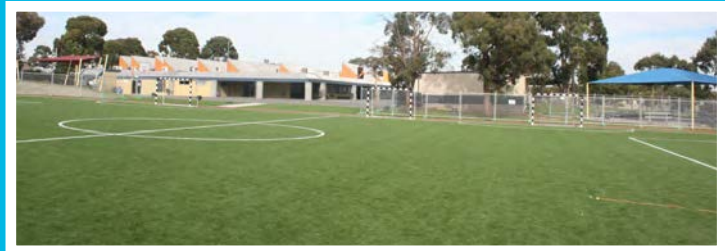
MEADOW FAIR BOYS CAMPUS